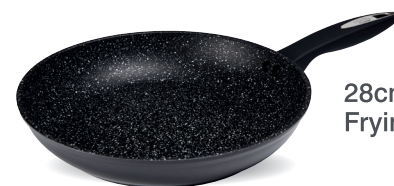
28cm / 11" Frying pan

ROCKPEARL + PLUS NON-STICK + SWISS TECHNOLOGY