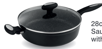
28cm / 11" Sauté Pan with Glass Lid