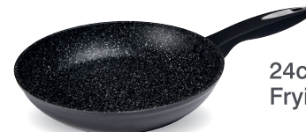
24cm / 9.4" Frying Pan