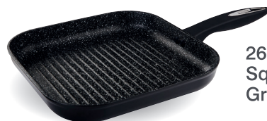
26cm / 10.2" Square Grill Pan