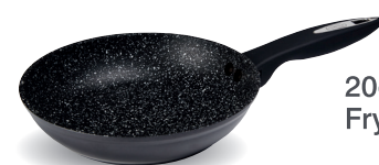
20cm / 7.9" Frying Pan