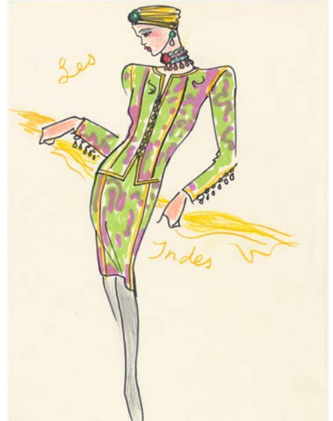
2 - Yves Saint Laurent Illustration sketch Musée Yves Saint Laurent Paris