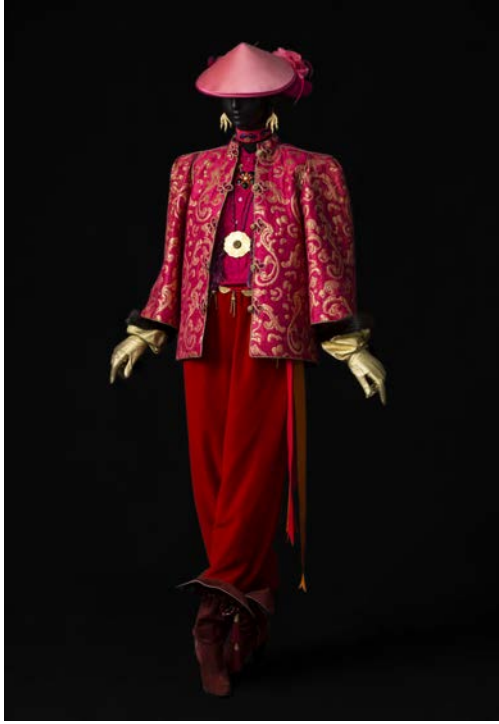
9 - Evening ensemble, Autumn-Winter 1977 Haute Couture collection