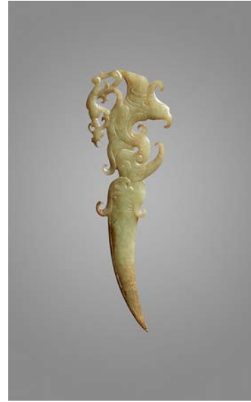
14 - Pendant in jade China, dynasty Zhou of the East, 4 th -3 rd century BC Sam and Myrna Myers collection