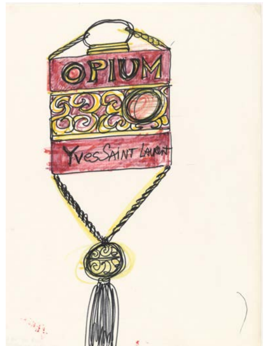
12 - Yves Saint Laurent Research sketch for the launch of Opium , circa 1977 Musée Yves Saint Laurent Paris