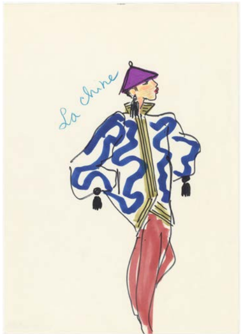
4 - Yves Saint Laurent Illustration sketch Musée Yves Saint Laurent Paris