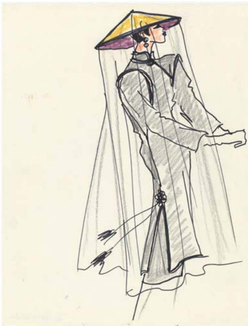
3 - Yves Saint Laurent Illustration sketch for the Autumn-Winter 1977 Haute Couture collection Musée Yves Saint Laurent Paris