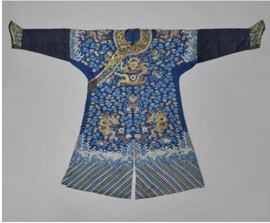
13 - Court dragon dress China, dynasty Qing, 18-19 th century Sam and Myrna Myers collection