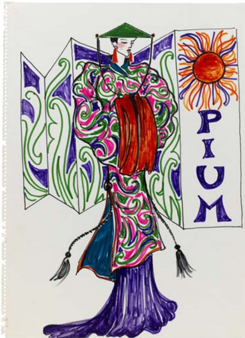
11 - Yves Saint Laurent Research sketch for the launch of Opium , circa 1977-1978 Musée Yves Saint Laurent Paris