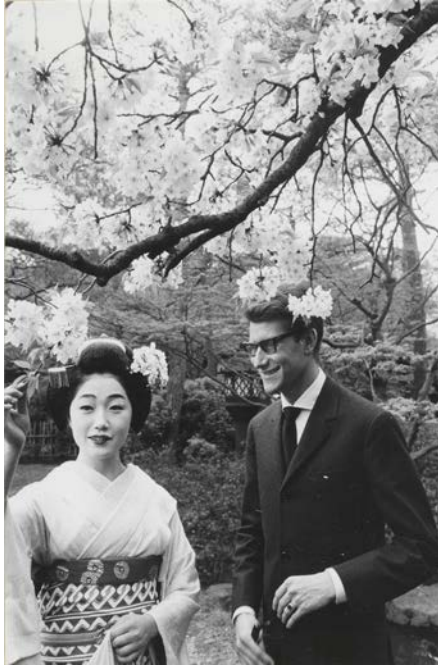
17 - Yves Saint Laurent and a courtesane wearing traditional garments during his first trip to Kyoto, Japan, April 1963