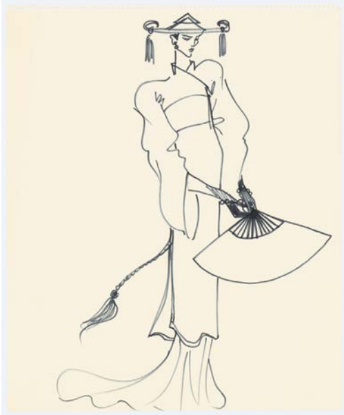
1 - Yves Saint Laurent Research sketch for the launch of Opium , circa 1977-1978 Musée Yves Saint Laurent Paris

These images may be used before, during, and up until the end of the exhibition "Yves Saint Laurent: Dreams of the Orient" (October 2 - January 27). They may only be used in order to promote the exhibition. Please mention the captions and credits for each image. The high-resolution files are available upon request.