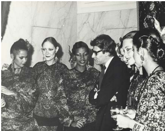
15 - Yves Saint Laurent and his models, during the French launch party of Opium , 5 avenue Marceau, Paris, 1977