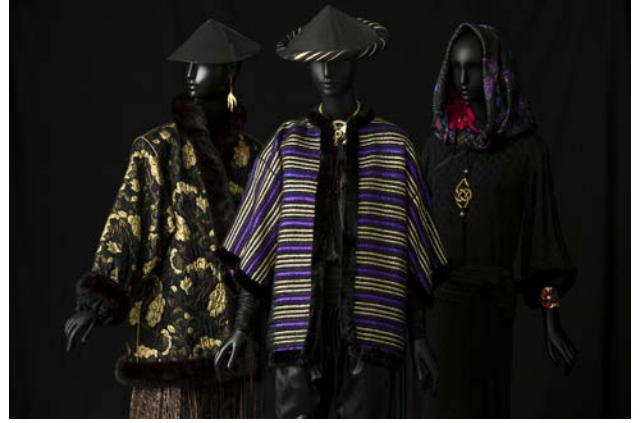
10 - On the left and center: Evening ensembles, Autumn-Winter 1977 Haute Couture collection On the right: Evening dress, Autumn-Winter 1977 Haute Couture collection