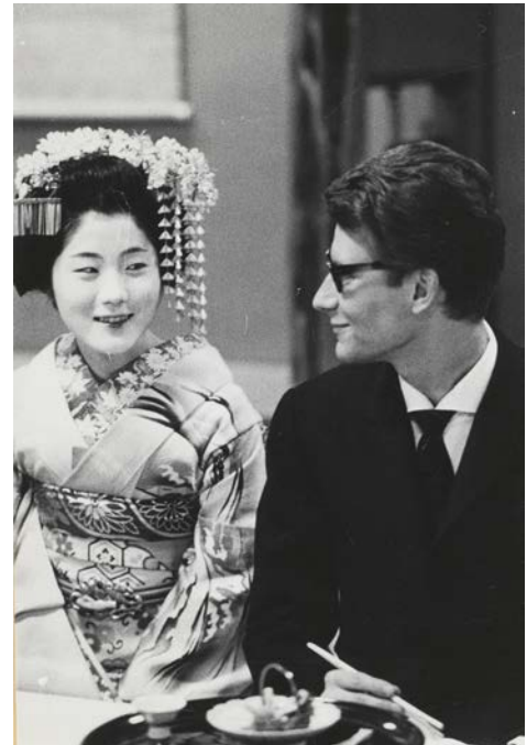
16 - Yves Saint Laurent and a courtesane wearing traditional garments during his first trip to Kyoto, Japan, April 1963