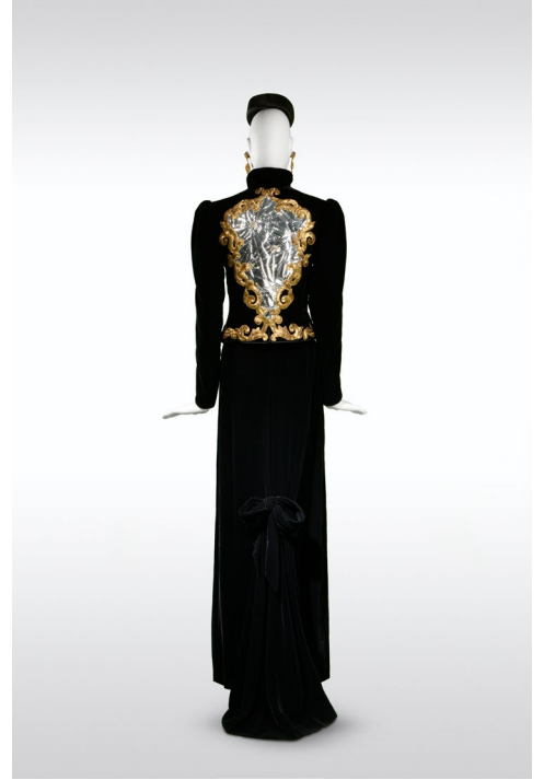
2 - Evening Jacket, known as « Broken Mirror » Autumn-Winter 1978 Haute Couture Collection