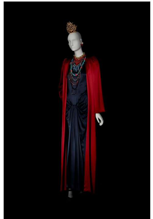
8 - Evening Ensemble Spring-Summer 1980 Haute Couture Collection © Musée Yves Saint Laurent Paris / Alexandre Guirkinger