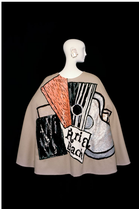
3 - Evening Ensemble – Tribute to Georges Braque Spring-Summer 1988 Haute Couture Collection