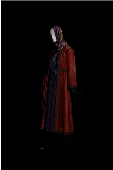
5 - Evening Ensemble Autumn-Winter 1976 Haute Couture Collection