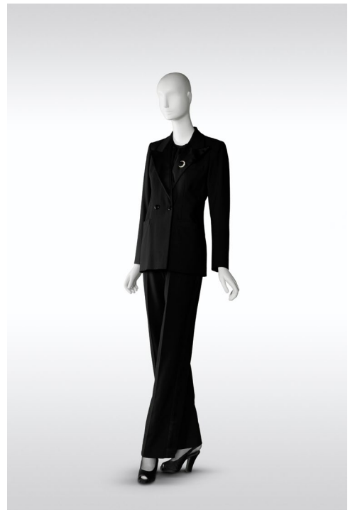
4 - Tuxedo Autumn-Winter 1971 Haute Couture Collection