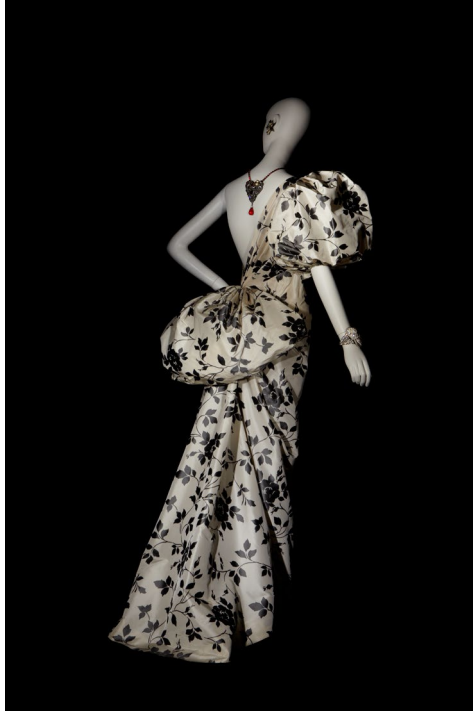
1 - Evening Gown Spring-Summer 1986 Haute Couture Collection

High resolution files are available upon request