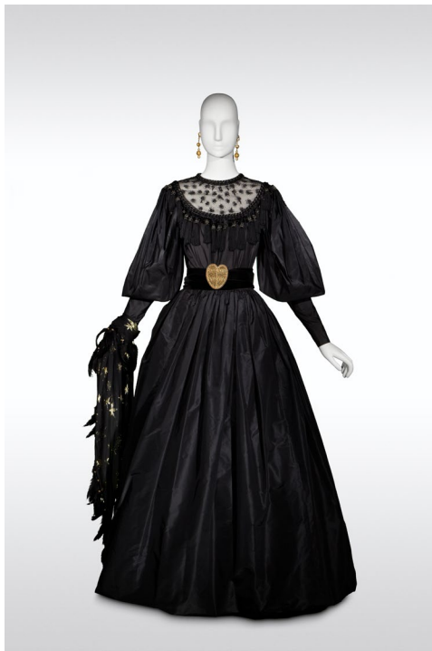
7 - Evening Gown Autumn-Winter 1977 Haute Couture Collection