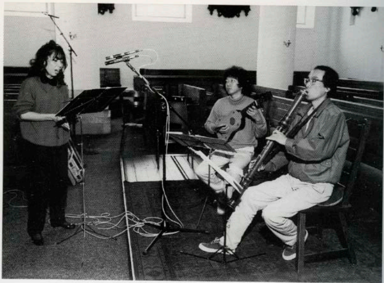
ENSEMBLE ALBA MUSICA KYO, recording session