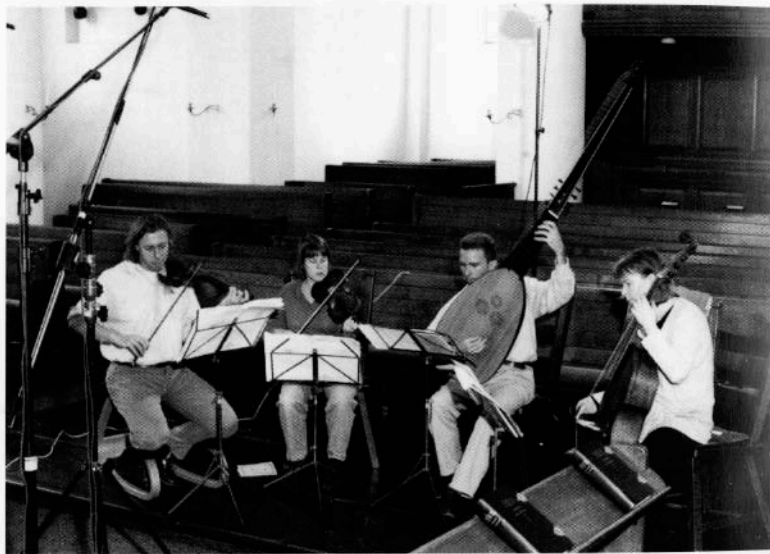
The Locke Consort photo recording session: Studio Veenendaal