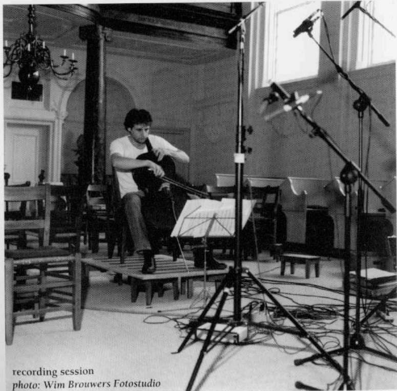
recording session