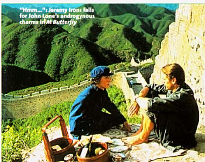
"Hmm...": Jeremy Irons falls for John Lone's androgynous charms in Butterfly