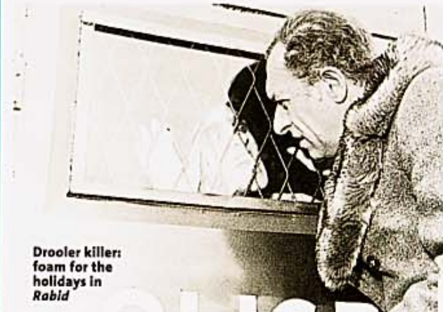
Drooler killer: foam for the holidays in Rabid

A fter leaving the science course, Cronenberg remained convinced he would be a writer. He enrolled to study English, Philosophy and History. He was dedicated for a while, until he met a fellow student who'd made a film. There were no film courses in Toronto at the time – studying film at university seemed as ridiculous as doing a PhD in stand-up comedy –