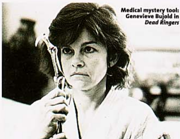
Medical mystery tool: Genevieve Bujold in Dead Ringers

But the downside is that it puts your psyche up for dissection. He still gets very angry, for