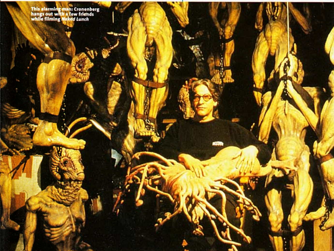
This alarming man: Cronenberg hangs out with a few friends while filming Naked Lunch