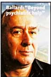
Ballard: "Beyond psychiatric help"

1970 April 4-28 Science fiction writer JG Ballard hosts a show at the Arts Lab in London. Titled 'Crashed Cars', it features three written-off vehicles – a Mini, an A40 and a Pontiac, which visitors are invited to a look at while a topless woman circulates among them. "I was the only sober person there," says Ballard. "Wine was poured over the crashed cars, glasses were broken, and the poor girl was nearly raped in the back of the Pontiac."