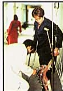
"And while you're down there..."

Nov 8 Before the film shows at the London Film Festival, Walker's outrage is recycled in the media. Heritage Secretary Virginia Bottomley says, "I would urge local authorities to use the powers they have to refuse the film a screen. All of us