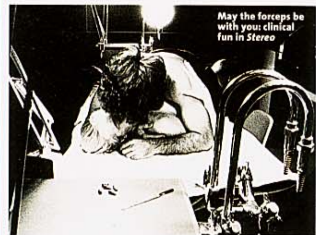
May the forceps be with you: clinical fun in Stereo

and the mere idea that someone he knew had actually made a movie astounded him.