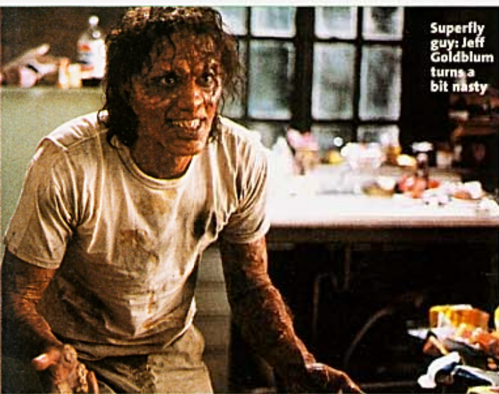
Superfly guy: Jeff Goldblum turns a bit nasty