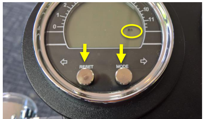
Picture shows MODE and RESET buttons (arrowed) and speed setting (ringed)

Actioned by: Denzel Collis Contact Details: Technical Services Manager – DDH Contact: 01274 475145