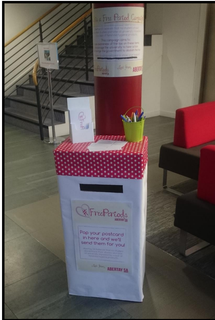
Figure 2 Library based post-box