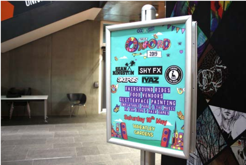
Advertising in and around Union Square