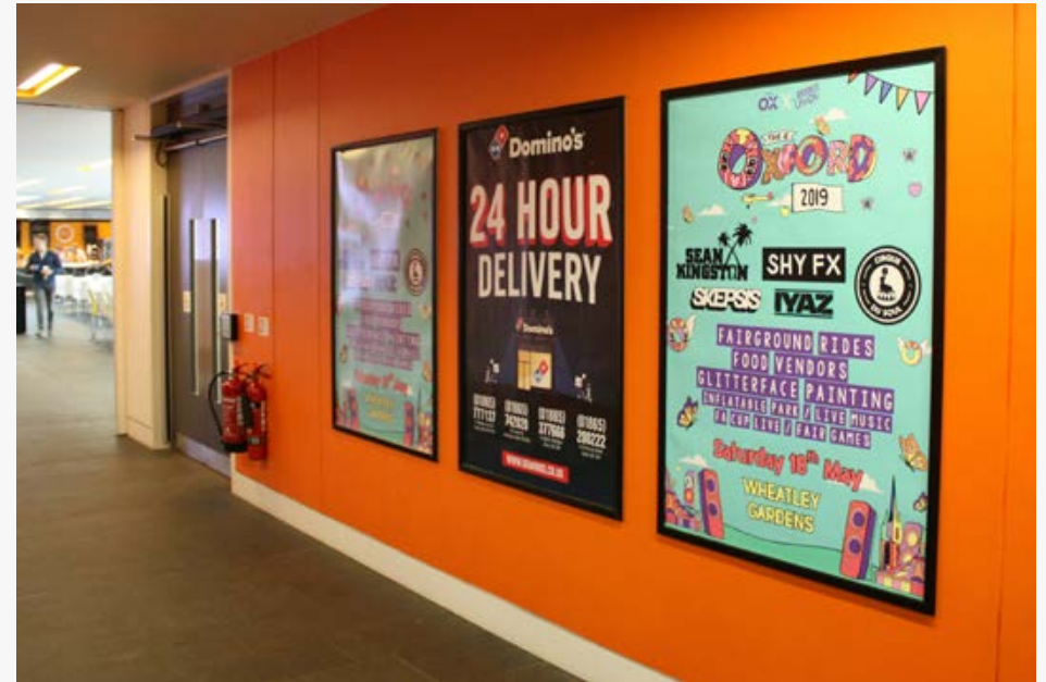
Extra large poster frames in Union Square.