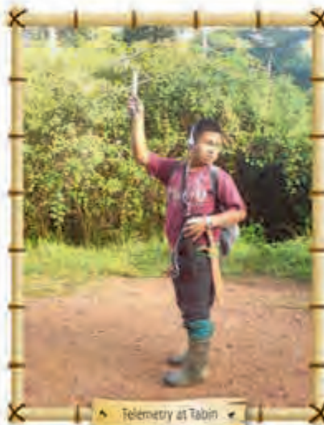
Telemetry at Tabin

Since our last newsletter in the summer, I've been travelling around keeping busy working on our core projects out in Borneo. Most of my time has been spent in Sabah, continuing our crucial work on the post-release monitoring project in Tabin. In 2012 we plan to release a further eight orangutans into the Reserve, so we spent much of last year carefully selecting only the best candidates from Sepilok. We regularly test these animals for any signs of illness or disease and we have also been assessing their behaviour. Any animals that could transfer disease and those that cannot build nests or forage for their own food will not be joining us on the project. Essentially we've been examining the candidate orangutans at Sepilok to see which are the most suitable to be released and tracked by my team and I. We hope to release the first group of four orangutans in February or March, and depending on their progress, the next group in the autumn.