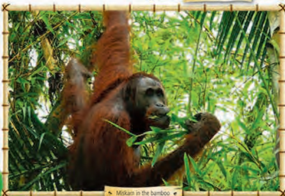
Miskam in the bamboo