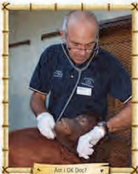
Am I OK Doc?