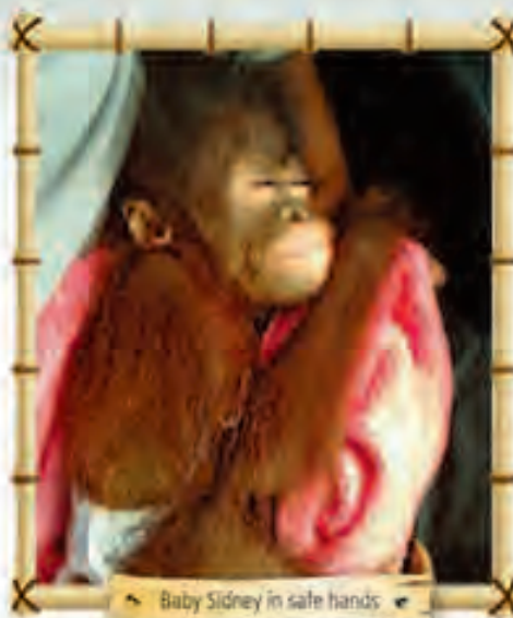
Baby Sidney in safe hands

The rescue was successful but sadly one of the orangutans, named Jimmy, had Down's