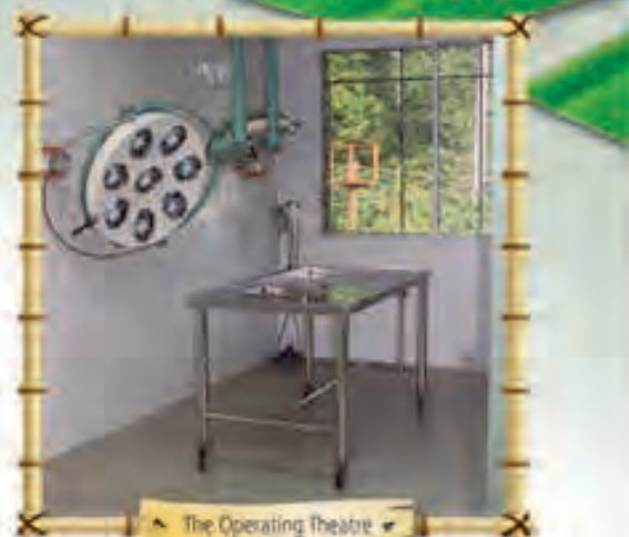
The Operating Theatre

We have had no serious injuries or acute illnesses to deal with and we have some good and some bad news to report. The lovely gentle Eynos sadly produced a stillborn baby in October but the good news is that after an extended period where she has had to be kept confined during 2011, we managed to release her back into the reserve in December. Eynos loves company and has a tendency to return to our buildings; but she is currently foraging well and travelling and nesting in the canopy tracked daily by the Appeal Research assistants, who monitor her activities.