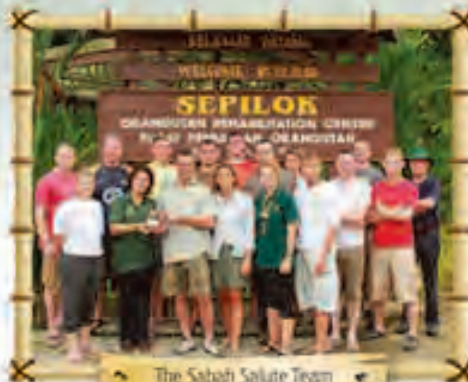
The Sabah Salute Team

A team of 14 Officers and Soldiers from the British Royal Regiment of Artillery visited Borneo to honour the lives of those lost during the Ranau to Sandakan Death Marches in