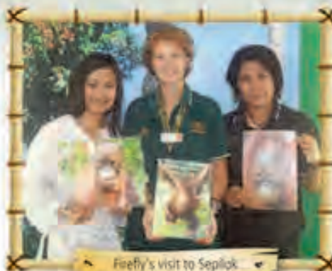
Firefly's visit to Sepilok