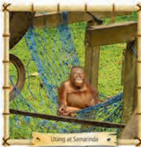
Utang at Samarinda