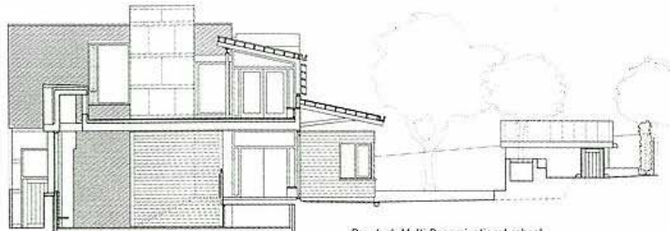
Ranelagh Multi-Denominational school

The conceptual origins of some of our recent buildings have been derived directly from our understanding of the characteristics of their sites. We begin by thinking like archaeologists might do, metaphorically prodding the ground, searching for traces of what made it the way it is and sifting to unearth clues to inspire its further transformation. Our ambition is to build something completely new that feels like it was already there before we started, as if we had discovered the scheme rather than designed it.