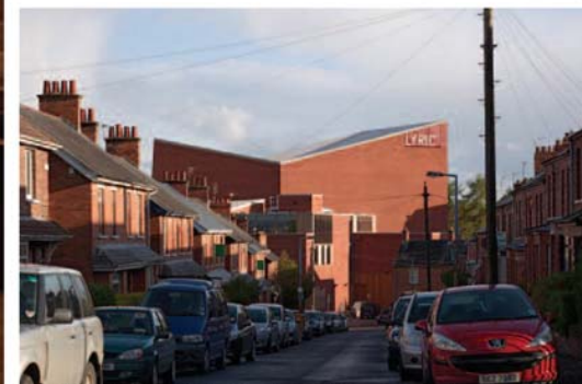
The building reflects the materials of its context, sited at the end of a street of red-brick houses.

"It was a very restrictive site, squeezed from all directions," says John Tuomey. "Yet we were working with big volumes of fixed dimensions that barely fit within the boundary in plan." The challenge was deftly overcome in section by the counter-intuitive move of flipping the auditorium so the rake ran against the slope, thereby opening up a usable chasm below. The architect also raised the rehearsal room to provide space beneath it for the bar. The three primary volumes, of theatre, studio and rehearsal room, are thus conceived as objects, pushed to the edges of the plot, leaving a stream of public circulation space to ▶