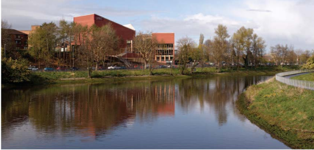
The peak of the theatre's fly tower rises above the treetops on the bank of the River Lagan.

SUBCONTRACTORS AND SUPPLIERS Mechanical and electrical Vaughan Engineering Group. Concrete and internal joinery Mastercraft. Primary and secondary steel Metatech. Brick (Isstock (Gilbert Ash), Windows (Hynds / JC Ramsay), Fitted furniture JC Ramsay, Stone (McCormells, Terrazzo (Fegan Terrazzo, Lifts (Kane, Ironmongery (MB Architectural, Flooring (Owen James Flooring, Theatre specialists (Multistage, Oxford Sound.