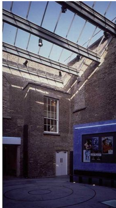
Plan of the surrounds of the Irish Film Institute (1992) in Temple Bar, Dublin, and its interior. Image: O'Donnell and Tuomey

So the idea that a site has some other building on it is not a problem and instead is interesting. How can you adapt something for contemporary use but also how can a new building work alongside and converse with it in a way that both the old and the new can coexist with mutual respect? There is a tendency, when working with old buildings, to simply add a glass box to the old building. That idea of contrast where you have something obviously modern sitting beside something old is a conversation but we don't think that it is a very interesting conversation. Sometimes this contrast just makes the old thing look sort of shabby and the new thing look shiny and new. We'd like to think there is a more subtle conversation to be had. Once your work is finished and you've gone away both these things coexist in the same time.