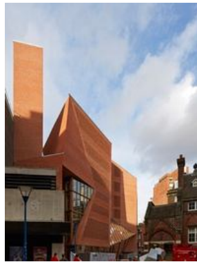
The London School of Economics Student Centre, 2014.

JT: Rilke was Rodin's assistant for a period and Rilke wrote a very interesting book on Rodin. In some way Rilke was trying to understand what Rodin was doing in his work, inside his sculpture and in the external relationships of Rodin's sculpture – the experience of a Rodin sculpture is often the space between you and the sculpture – it's not the object itself. It's the resonance that comes off the sculpture because it is not static, because it extends outside of itself. And Rilke writes very beautifully about that. All this goes to the fact that Rilke expects us to understand that ideas reside in things. I think that's a beautiful analogy about what an architect expects when an architect makes a building. The architect is actually transferring their thoughts into the thing that they are making. And there it sits – the thought is in the thing. And there it will stay until someone comes along and interprets it again.