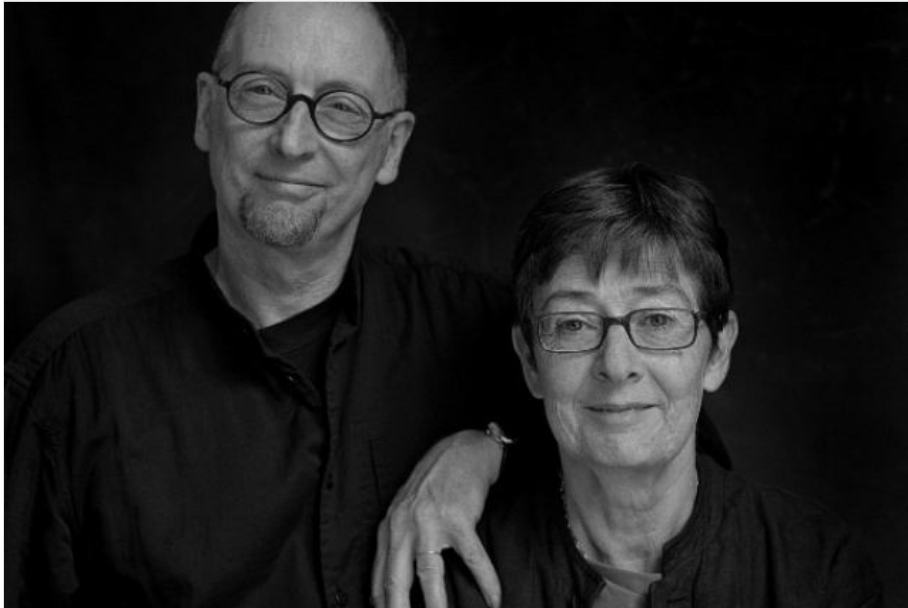
John Tuomey and Sheila O'Donnell.

Recently the New Zealand Institute of Architects held its annual conference. This year the conference was framed around the term “in situ” and focussed on the many contexts that influence the project of architecture. One of the highlights of the conference was, undoubtedly, the presentation by Sheila O'Donnell and John Tuomey. This year's RIBA Gold Medal winners, their architecture is deeply layered and generous. It gives back to its context in texture, experience and thoughtful attention.