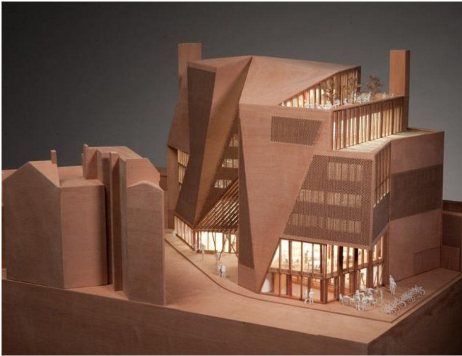
Model for The London School of Economics Student Centre.

JT: Rilke was Rodin's assistant for a period and Rilke wrote a very interesting book on Rodin. In some way Rilke was trying to understand what Rodin was doing in his work, inside his sculpture and in the external relationships of Rodin's sculpture – the experience of a Rodin sculpture is often the space between you and the sculpture – it's not the object itself. It's the resonance that comes off the sculpture because it is not static, because it extends outside of itself. And Rilke writes very beautifully about that. All this goes to the fact that Rilke expects us to understand that ideas reside in things. I think that's a beautiful analogy about what an architect expects when an architect makes a building. The architect is actually transferring their thoughts into the thing that they are making. And there it sits – the thought is in the thing. And there it will stay until someone comes along and interprets it again.