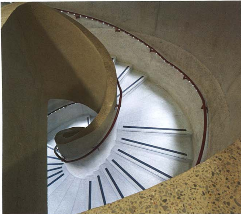
Lighting is integrated within the slim circular handrail design of the spiral staircase complementing the architectural form and shape. The handrail lighting also functions as emergency lighting during power outage or failure.

The fifth floor accommodates the Student Careers Centre. Due to the reduction of support columns, the uplighting components are addressed via horizontally mounted lighting poles onto which are mounted direction spotlights, providing both upward light and task orientated illumination. The central staircase terminates on the fifth floor and access to the sixth floor is provided via a circular staircase similar to that leading to the Student Coffee / Juice bar. The lighting changes here with the use of Innermost Circus pendants to provide a decorative element. The lighting control for the building utilises a central system, adopting a Dali protocol to enable future changes in the configuration of the lighting control and removing the requirement for alterations to the wiring infrastructure, minimising alterations to the building fabric or extensive manual labour to carry out future