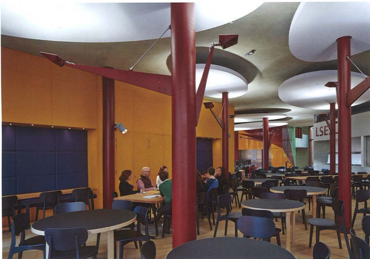
The student bar and café features Bega uplights to provide indirect light distribution producing a space that is visually comfortable, with a sense of ambience. The triangulated design of which complements the support structure to depict the form of trees.

main event space and nightclub. Lighting is integrated within the slim handrail design, again complementing the architectural form and shape. The handrail lighting also functions as emergency lighting during power outage or failure.