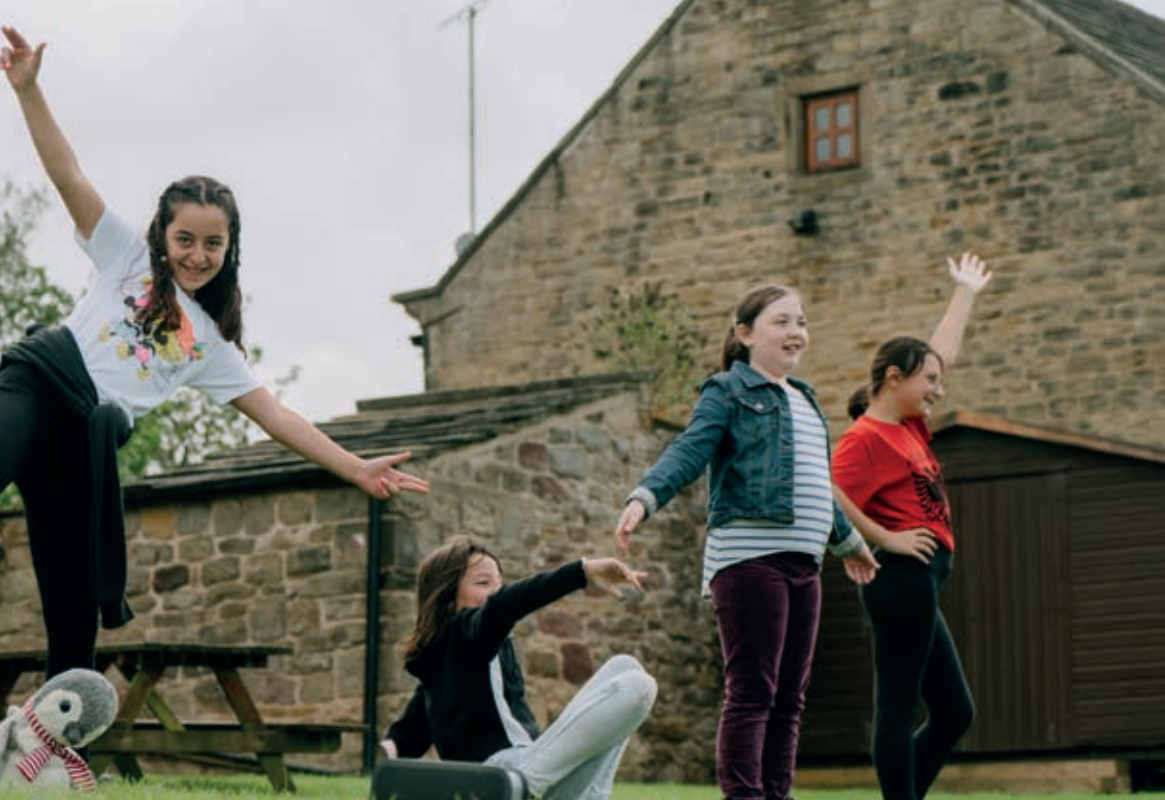
Left: Creative Arts Camp, Herd Farm, Leeds, August 2020