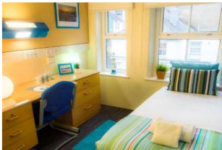
Britannia Study Hotel room