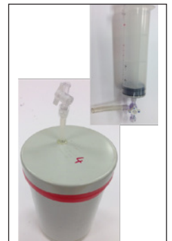
Sampling for GHG along CAREX waterways - Soil gases were collected using field chambers that were placed along 50m transects at 4 CAREX waterways (~1m away from water's edge).