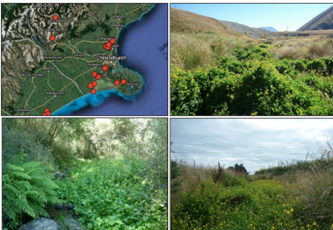
Aquatic plants were surveyed in 28 sites across Canterbury, including high country, Banks Peninsula and lowland waterways.

Over the past few months, we have started to wrap up trials for some aquatic weed and nutrient tools and completed a survey to better understand the factors influencing the growth and distribution of aquatic plants (aka macrophytes) across Canterbury. Results of Katie's macrophyte survey coming soon! We are busy processing lab samples, analysing data, preparing new toolbox resources, and presenting our findings to local groups and at national and international conferences on freshwater and restoration.