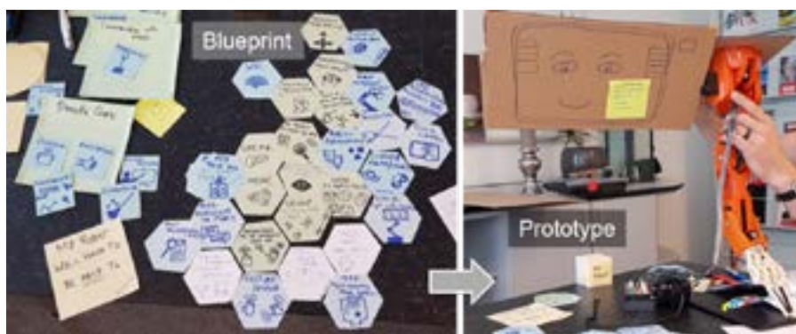
Figure 6. Tom designed a cooking assistant with a digital face, an interactive touchscreen and an arm for cooking-related tasks