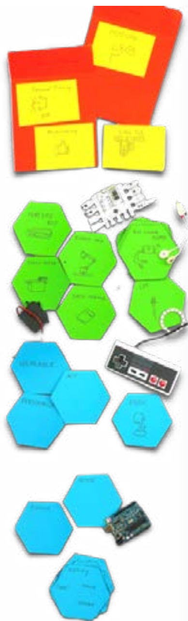
Figure 8. The Co 3 toolkit was designed to allow participants’ creativity to emerge, by providing the right contextual materials. Materials that afford the occurrence of highly situated and personalized concepts.

This exploratory project has produced a toolkit of linkable social robot building blocks centered around which is a holistic, novel process for conducting social robot participatory design with cognitively impaired individuals. That process has artefacts meticulously designed with the participants in mind – giving the artefacts sufficient scaffolding to make co-design navigable by bridging the impairments in imagination and social interaction of the involved participants. The project aims to inspire a movement of open-source, scalable and democratized social robot co-design, which in the end can be facilitated by a social robot itself (which works with participants to co-design itself) and which can empower egalitarian inclusiveness in (co-)design of all users – to evoke questions on which human-robot interactions to design in the first place and why.