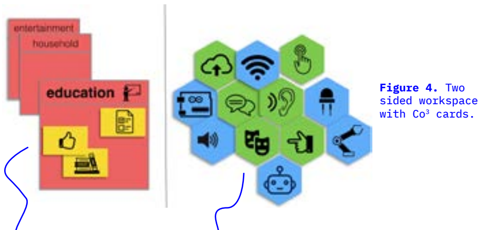
Figure 4. Two sided workspace with Co 3 cards.