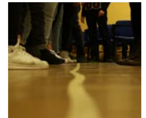
Figure 7. The game of the line

At first anthropological sight, such modality has allowed an approach to the activities based on a more relational and collaborative mode, to which the participants were not used in their schooling routine. In fact, despite they live the experience of closeness in the classroom, such activity has evidenced their reluctance to collaborate and the embarrassment provoked by a working mode more free and where physical contact is stronger. Such aspect emerged already in the course of the first class activity, where the participants changed from a rigid posture and physical detachment to a more relaxed one (for example their bodies were relaxed, leaned on their desks), in search of a visual and bodily contact with their schoolmates working in the same group. Concerning technologies, the very fact that teenagers use them with great ability does not mean that they know them or that they are 'in love with or dependent on' them;