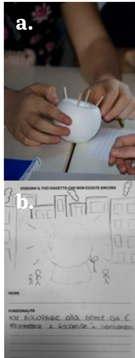
Figure 2a The workshop with interactive objects, participants tinkering with the object.