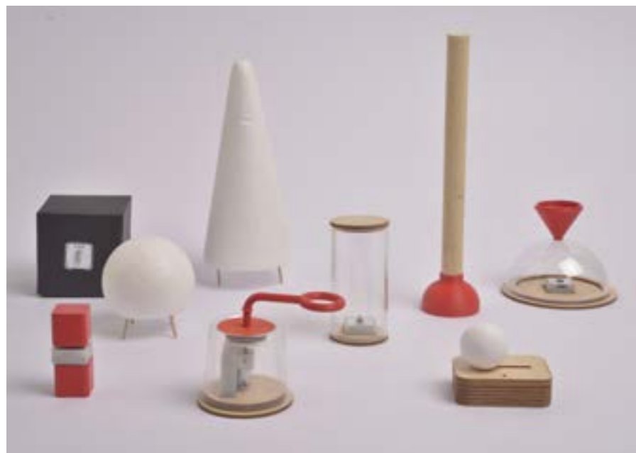
Figure 3. The interactive modular objects to be used in the second workshop for participants to enact their stories and create fictional scenarios for future smart objects.

The outer shell of the capsule was designed through an iterative process which was fed by continuous feedbacks of the first 24 participants. Four types of prototypes were produced by using different materials, techniques, and technologies, and were used/tested by the same group of participants until it got its final shape (Fig.5). The first one was a transparent capsule-shaped container that was actuated with a conductive surface on the top of the capsule by using the Bare Conductive Touchboard (2018). When the capsule was touched, one of the sound files was played randomly through the micro-speaker