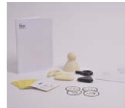
Figure 1. The items inside the Futuring Box.

who, where) indicated on this paper in order to brainstorm about various smart object ideas. Each group's reporter presented their result to others and a discussion session was done about the emerged themes and ideas. Based on the results of this brainstorming sessions, the design researcher developed 9 different interactive objects - "things to act with" (Brandt and Grunnet, 2000) - to be used in the following workshop to turn the concepts into tangible ideas and enact their scenarios with an instant interaction (Fig.3). These interactive objects were modular geometrical shapes embedded with Bluetooth-connected sensors and actuators (SamLabs 2018) in order to help participants to pass to a more hands-on stage with the scenario building. While the modularity of the objects gave them the possibility to de-construct and re-construct the objects, the sensors and actuators helped them enact the interaction. In the second workshop, each group created a story for their smart object and visualized/textualized their scenarios on the sheets provided. At the end of the workshop, each group's reporter presented a scenario in which the future smart object was depicted (Fig.2a,b).