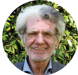
Prof. Michael Boppré

Relationships of Arctiini to plants containing 1,2-dehydro pyrrolizidine alkaloids (PAs) are of two kinds: i) for larvae of some species PA-plants represent primary hostplants for gaining nutrients for development, ii) for adults of other species PA-plants serve as secondary hostplants, exclusively for obtaining PAs via a peculiar behavior that is independent of nutritional requirements (PA-pharmacophagy). In both cases PAs are sequestered for defence against antagonists, and males of diverse species synthesize male courtship pheromones from PAs; thus, PAs link intra- with interspecific chemical communication. We know of exciting biology about a few species and of some peculiarities of PA-pharmacophagy, however, we appear to be far away from sound generalizing statements and from understanding the evolution of arctiine-PA relationships. The paper comparatively discusses what is known but focuses on what can be expected from further natural history studies, exemplified by a plea to employ PA-baiting. Studying arctiine-PA relationships is integrative and has high potential to contribute to general biological issues, including aspects of human health.