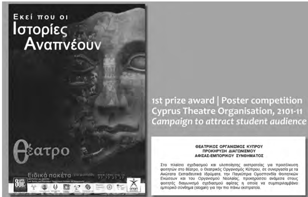
figs 11 & 12