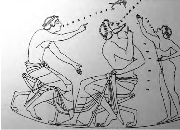
fig.4 — Look, a martlet! — There it is... — Thank God, spring is here.

department's students and faculty members– to participate in various, so called, “artistic contests and competitions”.