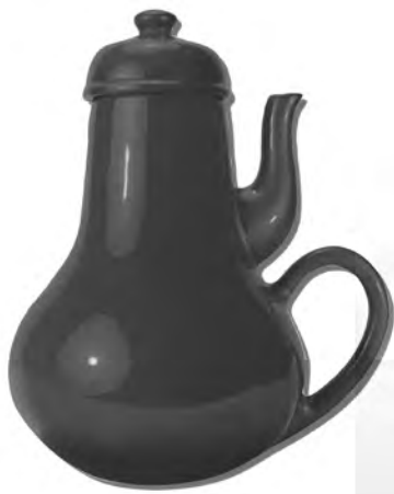
figs 2 & 3

From then on, day after day, I kept receiving numerous phone calls, emails and correspondence from people in the private and public sector, working for profit or for not for profit companies, all of which were –more or less– about the same thing: they asked (or invited) me –and, through me the