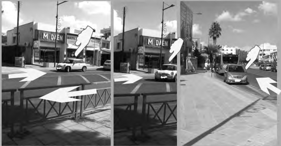
© Felix Scharmer | OCT 2011