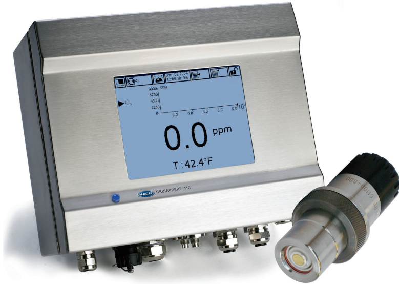
The Hach Orbisphere C1100 Ozone Sensor together with 410 Controller is the only inline sensor for ozone monitoring.