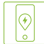
Select POD Point In App