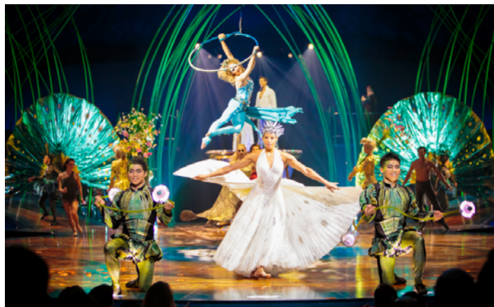
Amaluna – Cirque du Soleil

The story began on 1 May 1995. It was the day when PortAventura opened its gates and started to welcome millions of visitors over the years from all around the world to become a benchmark in southern Europe for leisure and entertainment for the whole family. Over the last 20 years, more than 60 million people have enjoyed the delights of PortAventura and its mascots.