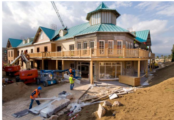
New building The Callaghan's

In addition, on 7 May the first stone will be laid for the construction of the FerrariLand theme zone , entirely dedicated to the legendary Italian brand and a one-of-a-kind in Europe. This project represents an investment of 100 million Euros , once again reflecting PortAventura's commitment to attract new types of customer and to strengthen interest from the international market.