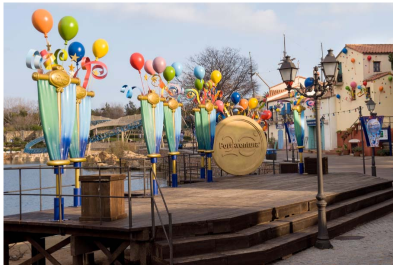
20 th anniversary decorations