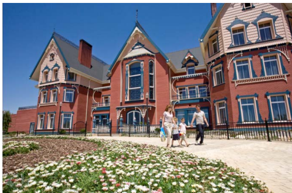
Hotel Mansión de Lucy

With an investment of 10 million Euros in hotel projects, PortAventura strengthens its international expansion strategy and reinforces its commitment to attract customers from the Premium segment of the market. This is demonstrated by the transformation of Mansión de Lucy into the resort's first 5-star hotel , opening 2 April, and the expansion of Hotel Gold River with the Callaghan Building , which hosts 78 new Deluxe rooms.