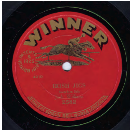
Shamrock 2022 and its acoustic original of 1914: Edison Bell Winner 2582