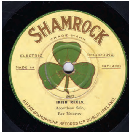
Shamrock record of June 1929 purporting to be of Irish traditional music