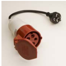
1000-772 415V Adaptor lead (5 pin) to AU 16A