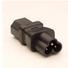
2000-551 Plug adaptor IEC C6 - C13 (3way 5A PSU)