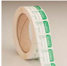
1000-971 Roll of 1000 PASS test labels