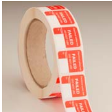
1001-227 Roll of 1000 FAIL test labels