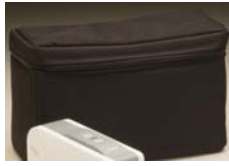
2001-044 PAT Accessory Pouch