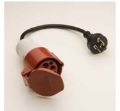
1000-769 415V Adaptor lead (4 pin) to AU 16A

Megger Instruments Limited Archcliffe Road Dover Kent CT17 9EN England.