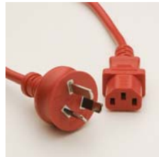
2000-883 Extension lead Adaptor (ELA) 230V AU