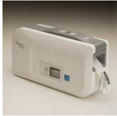
1001-046 Pass/Fail barcode label printer (USB) (PAT400 only)