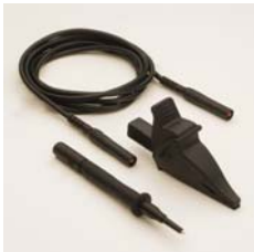
2000-870 Continuity / Earth Bond lead + Probe (Black)