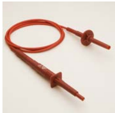
5310-401 Flash Lead 3.0KV 3.5mA (Red)