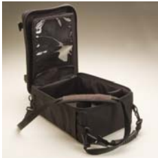
2000-962 Carry case with lead/document pouch