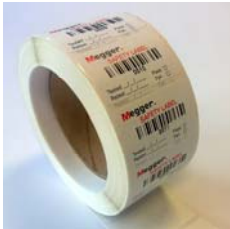
6121-483 Appliance bar-code labels (1-1000)