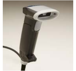
1001-047 Bar code Scanner (USB) (PAT400 only)