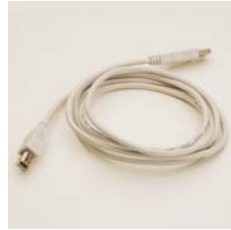
25970-041 USB Printer Lead (PAT400 only)