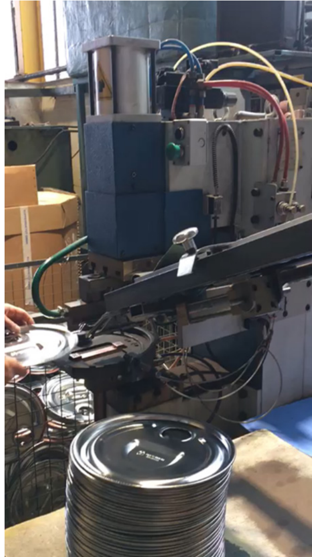
Figure 2: A spot welding machine used to weld handles on to metal lids

The VisNet Hub will provide LV network operators the visibility required to manage and understand situations like these. If you would like to know more about the VisNet Hub and its many capabilities, please click here .