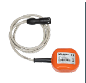
TFS CI – twisted field sensor