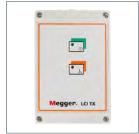
LCI TX – transmitter for energised cables (100-240 V) and phase-to-phase identification (240-440 V)