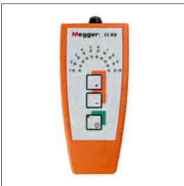
CI RX – universal receiver