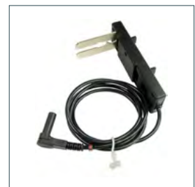
MK 55 Test lead with NH-tap (00-03) for LCI TX