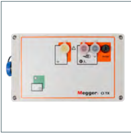
CI TX-1 – transmitter for de-energised cables