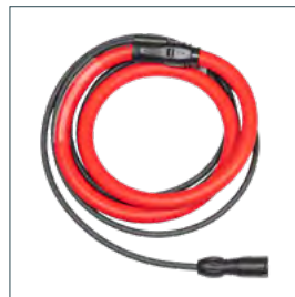
Flexible clamps 150, 250