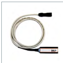
PAS CI Phase identification sensor