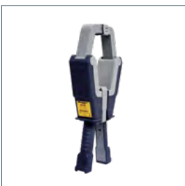
SZ-80 set Transmitter clamp for CI TX generator