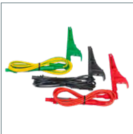
Lead kit for CI