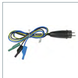
MK 37 (EU, UK, US, AUS/CN) Test lead for connection of LCI TX to power outlet