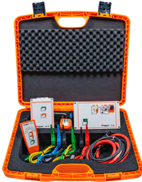
Complete set CI/LCI