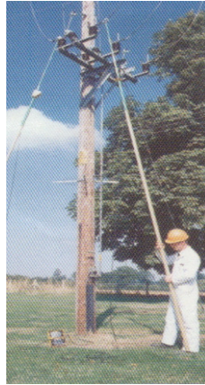
Cross Arm Leakage Kit in use.