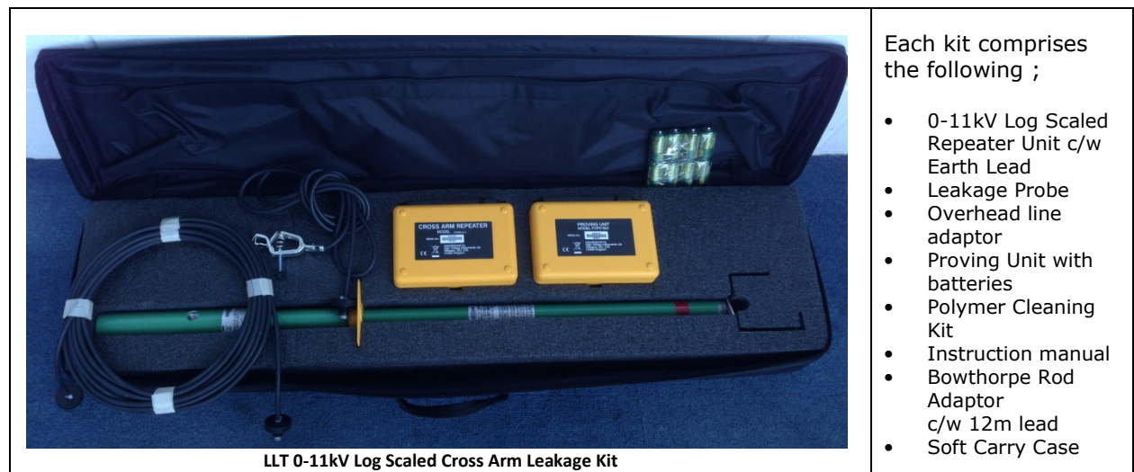
LLT 0-11kV Log Scaled Cross Arm Leakage Kit

The Cross Arm Leakage Kit provides for the use of a Bowthorpe Rod Adaptor fitted to the Leakage Probe to allow standard Bowthorpe Poles to be attached. This will extend the reach of the Probe to enable the Cross Arm to be reached from the ground Any leakage detected will be indicated on the Repeater Unit scale.