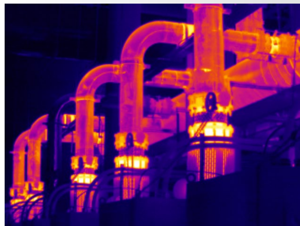
MultiSharp Focus, available on the RSE300 and RSE600 Infrared Cameras