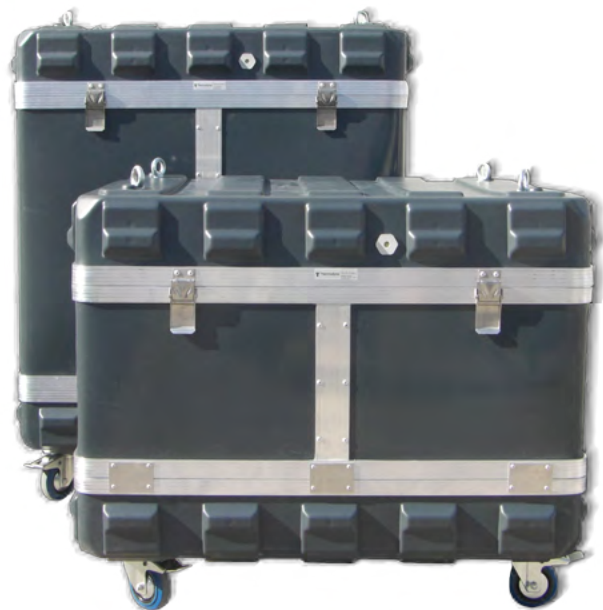
Transport container VLF CR-60

The modified offshore system found in the VLF CR-60 meets all applicable requirements for sea-bound operations. Optional transport containers are also available, which protect the system against water ingress. The VLF CR-60 can be stored and transported easily in these containers. The VLF CR-60 can be stored and transported easily in these containers.