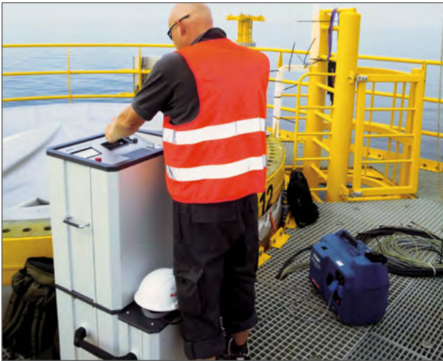
VLF CR-60 kV in operation on the "Baltic 1" wind park (Baltic sea).