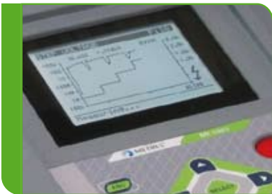
Real time resistance against time graph plotting facility