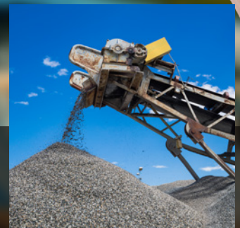
MINING AND RAW MATERIAL HANDLING

The Fluke ii910 Precision Acoustic Imager with MecQ™ is a powerful solution that can significantly reduce unplanned downtime by locating potential issues in conveyor systems so they can be addressed on your maintenance schedule.