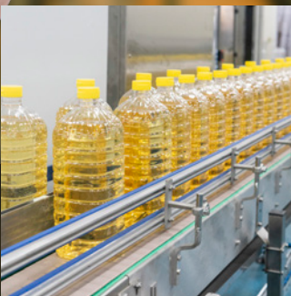
FOOD AND BEVERAGE PRODUCTION