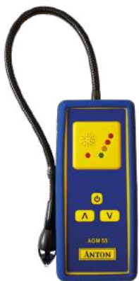
Part No: AGM-55