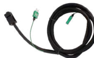
Sprint Pro 2m Flue Pro Extension