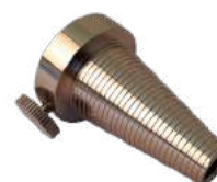
Pro Depth Gauge