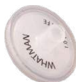
Sprint Pro PTFE Filter x 10