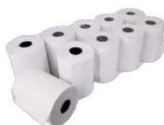
10 x Spare Paper Rolls for Printer