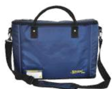
Pro Drop-in Bag