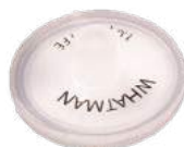
Sprint Pro Oil Boiler Kit Spare 3 Micron Filter