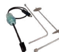
Sprint Pro BS7967 Probe Set with Water Trap