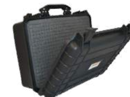
Sprint Pro Hard Carry Case