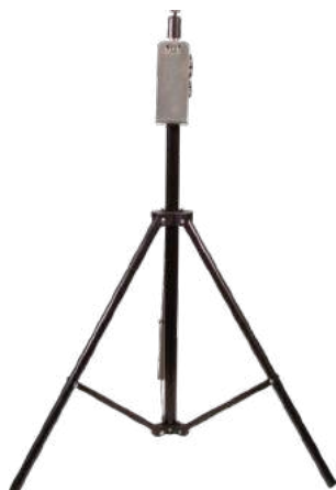
Tripod Stand for Ambient CO Testing