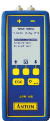
Part No: APM-155

APM 145 differential pressure meter with Bluetooth for Sprint Mobile app compatibility*