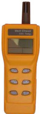
Part No: IAQ8494