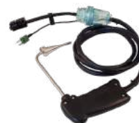
Sprint Pro Bent Flue Probe with Water Trap