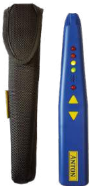
Part No: AGP-45