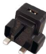
USB Charger Adaptor