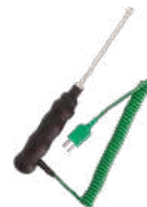
Surface Temperature Probe*