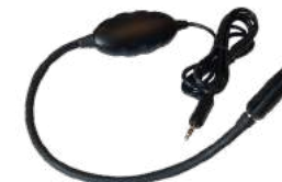
Pro Gas Escape Probe