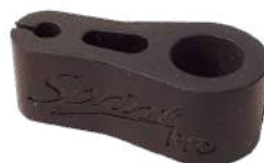
Sprint Pro Cable Management Clip