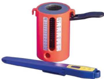
Part No: FLOWMATE-ADST-B

Flowmate II measuring cup flow meter and ADST pocket thermometer bundle