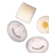
Pro Filter 4 Pack (2 x PTFE Filters and 2 x Dust Filters)