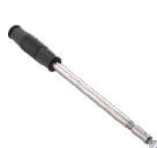
Sprint Pro Extendable Probe Handle