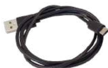
USB-C Charger / Comms Lead