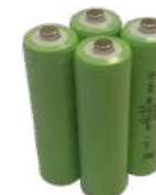
Sprinter IR Printer Rechargeable Batteries