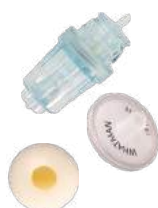
Pro Water Trap and Filters