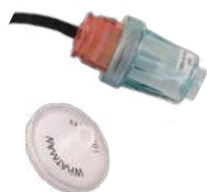
Sprint Pro Oil Boiler Kit with 3 Micron Filter