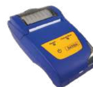
Sprinter Printer USB*