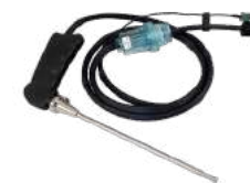
Pro Standard Flue Probe

Please note: Sprint Pro probes and accessories are not compatible with any previous Sprint FGA models.