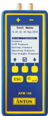
Part No: APM-145

APM 145 differential pressure meter with Bluetooth for Sprint Mobile app compatibility*