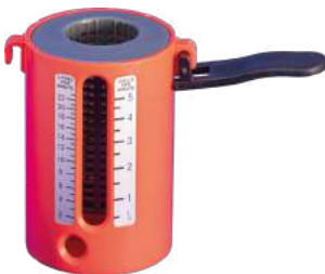
Part No: FLOWMATE-II

APM 155 differential pressure meter with Bluetooth - suitable for medium pressure and strength testing up to 2 bar*