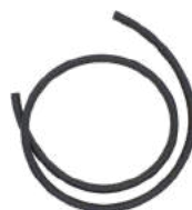
Pressure Hose 1m*