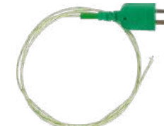
1m Air Probe*