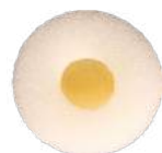
Sprint Pro Dust Filter x 10