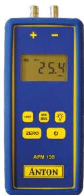
Part No: APM-135