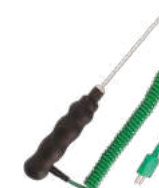
Liquid Binder Probe*