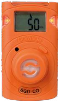
Part No: CL-C-30