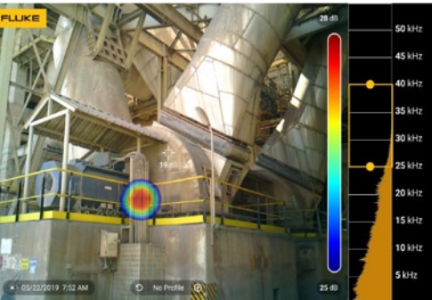
Air leaks detected in a cement plant with the ii900 Sonic Industrial Imager.

Cement manufacturing process involves several phases where the process temperature needs to reach up to 2000 °C. These high temperatures result in equipment deformation, making it very likely for leaks to appear in various locations. These leaks decrease process temperature, which in turn increase coal or gas consumption to compensate for the temperature drop.