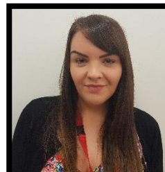
Chelsea – NEO Star Room