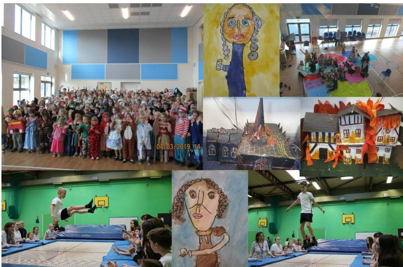
Some of the activities and work that have taken place this Spring Term.

Photos from Year 5's Class Assembly and their Anglo Saxon day trip at Escot can be seen on the Year 5 Class Page on the school website.