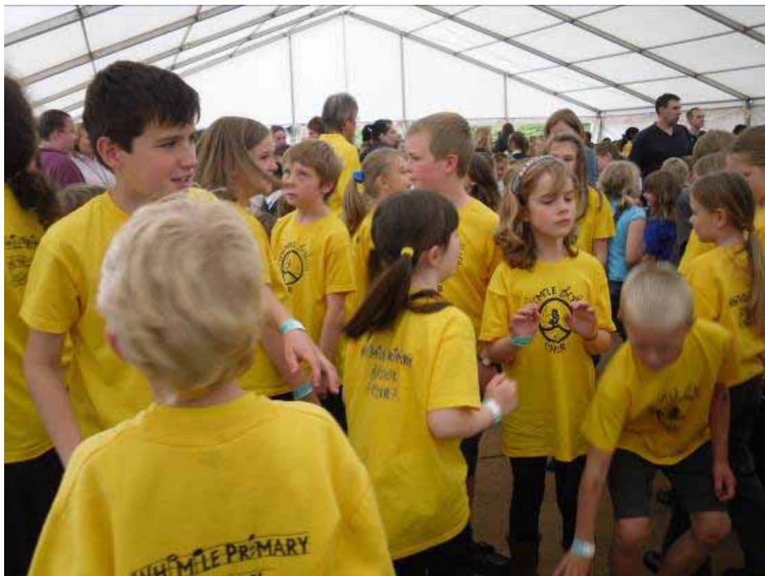
Dancing at the ceilidh workshop.