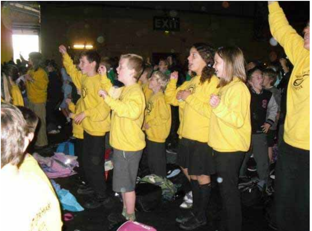
Dancing to Bhangra with children from across Devon.