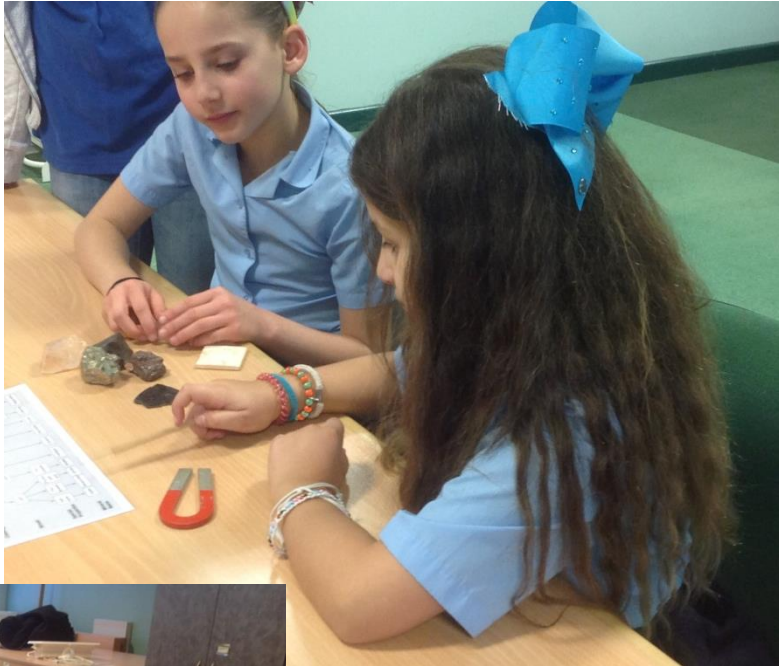
Year 4 also participated in a geology workshop at Plymouth University on Tuesday morning, revisiting some previous learning from Year 3 and developing some new scientific observational skills.