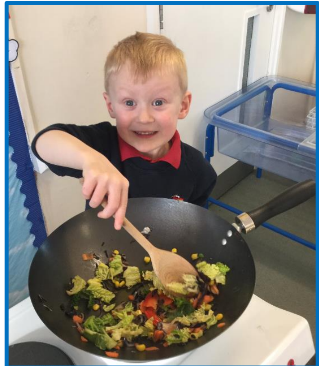
The EYFS Team

Our Early Years children had a great time learning about Chinese New Year. They cooked their own delicious noodle stir-fry!