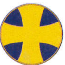
St Joseph's RC Middle School