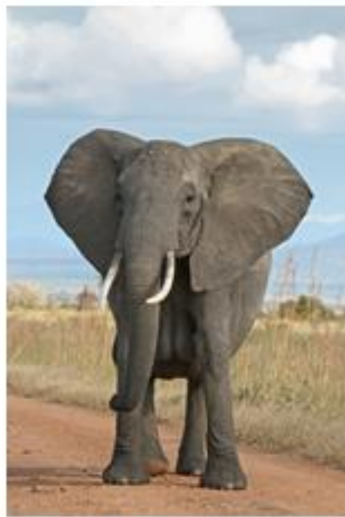
A bull elephant

Elephants are usually very gentle but can get quite cross. Elephants are very clever and know how to find water even when it is far away. When they find water they like to swim.