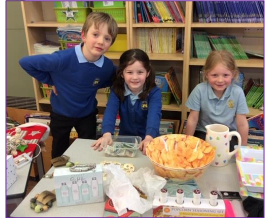
Eager helpers at the jumble sale