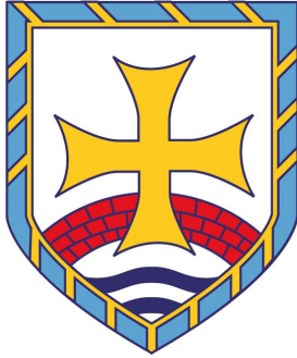
CHANTRY MIDDLE SCHOOL