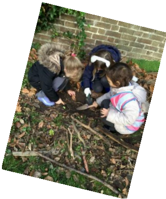
Early years enjoying forest school

It has been great to see everyone back after Christmas break and to see children enjoying their learning in 2019!