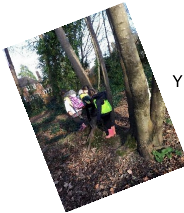
Y1/ 2 at the woods.