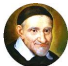
Feast of St. Vincent de Paul