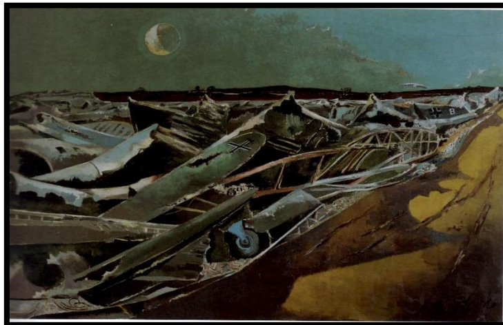
'Totes Meer' (Dead Sea)

Look at the painting above. What feeling does the huge watery sunset add?