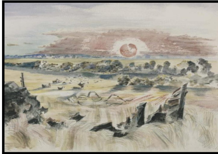
'Bomber in the Corn'

Look at the painting above. What feeling does the huge watery sunset add?