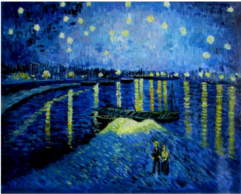
Starry Night Over the Rhone

Van Gogh was a Dutch painter. He was famous for the use of bright colours and big, bold brushstrokes. He painted in a style known as 'Post-Impressionism'. Vincent Van Gogh painted over 900 paintings in the space of 10 years. Unbelievably, he only sold one painting in his lifetime, called 'The Red Vineyard'. Like many painters he only became famous after he died.