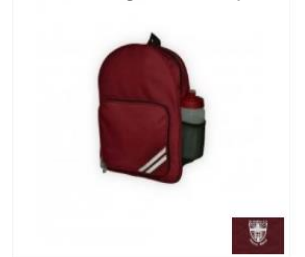
Year 3, 4, 5 and 6 back packs