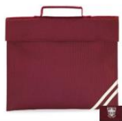
Reception, Year 1 and Year 2 book bags

Children in Key Stage 2 should only be bringing in a small back pack or bag to carry a homework book, reading book and water bottle.